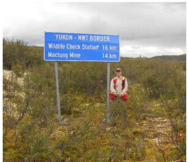
Yukon, summer 2011