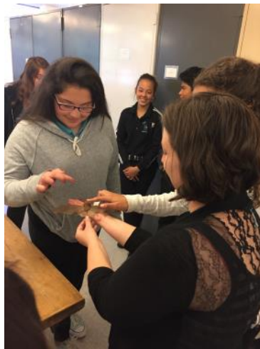
A student getting to touch the bat specimen.