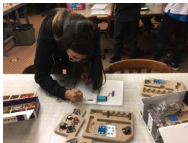
A student completes an engineering experiment by creating her own electrical circuits.