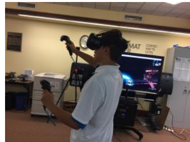
A student tries out the virtual reality video game.