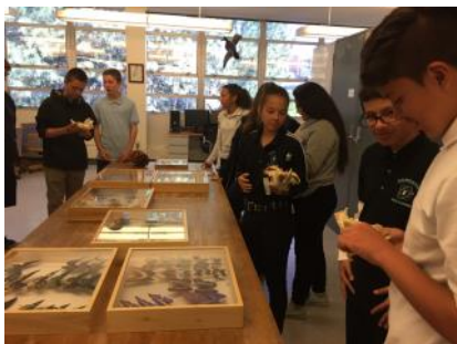
Students pass around a jawbone of a small mammal and gather around the butterfly collection at the Natural History Museum.

Again, I have to thank our generous sponsors at GSN, and the Redfield Foundation, for making this day possible. The rewards for our students are directly aligned to our vision as a STEM education facility, hoping to inspire our students and expose them to as many scientific fields and careers as possible. Dilworth STEM Academy is extremely lucky to have had this field trip experience!