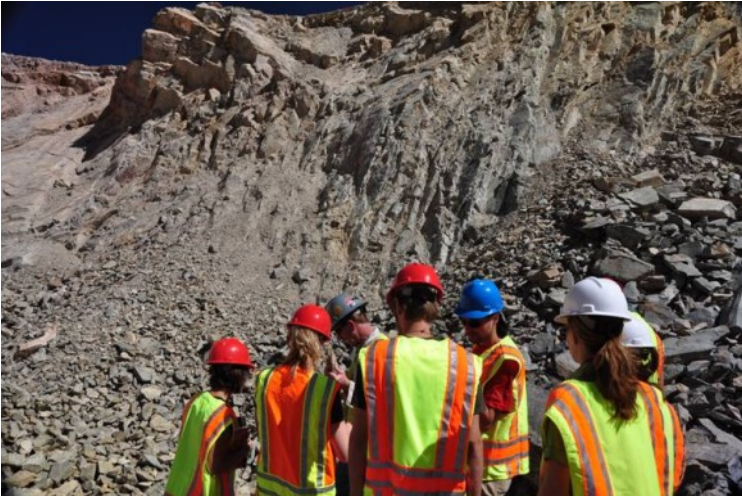
Checking out the rocks and looking for gold in the Round Mountain pit.