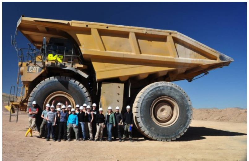
That is one big mining truck you got there!

During our visits we received expert guidance, information, and valuable insight into modern gold mining and the logistics and economics that drive the business. We felt privileged to visit the Nevada mining community and two very interesting and modern mines and would like to express our gratitude to Newmont and Kinross for hosting us.