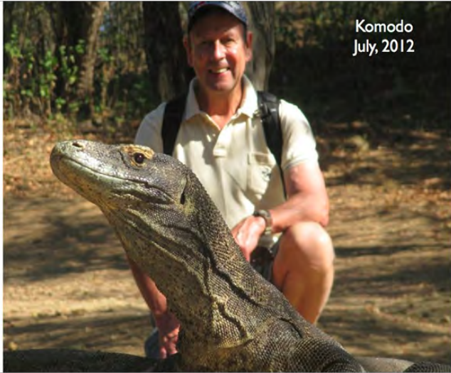
Komodo July, 2012

Like many kids, dinosaurs fascinated me, as did expeditions of any kind (but best if led by Tarzan). Roy Chapman Andrews soon became my hero with his tales of discovering dinosaurs and their eggs during his amazing expeditions to the Gobi Desert. My youthful days were spent mostly outdoors – exploring with my dog: catching frogs, snakes, and anything else that moved; and of course, investigating rocks.