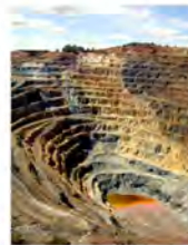
VMS Cu-Zn- Pb