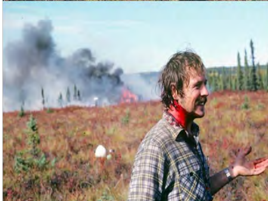
The demise of helicopter N8363F

.....a good lesson in the glide ratio of a flat rock