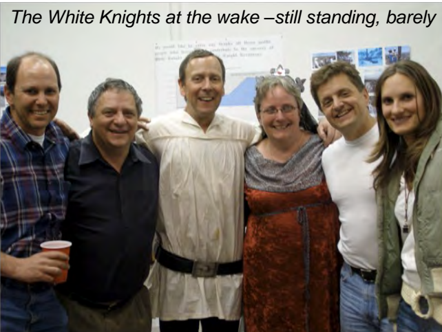
The White Knights at the wake – still standing, barely