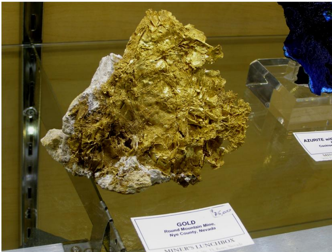
Round Mountain Gold Specimen priced at $75,000

We visited the 60 th Annual Tucson Gem & Mineral show in mid-February. This year's show theme was Gems, Gold, Silver, and Diamonds. Particularly intriguing were numerous gold specimens from Round Mountain, commonly for sale in the $6,000 to $75,000 range.