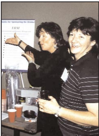
Stop 2. ERM sponsors the refreshments.