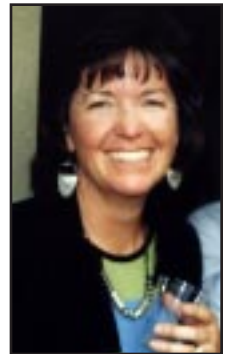
Stop 1. Hostess with the mostest!

Rumor has it that GSN may start an annual "Summer Concert Series" next year in the backyards across Nevada just in case there are any musicians out there who are interested.