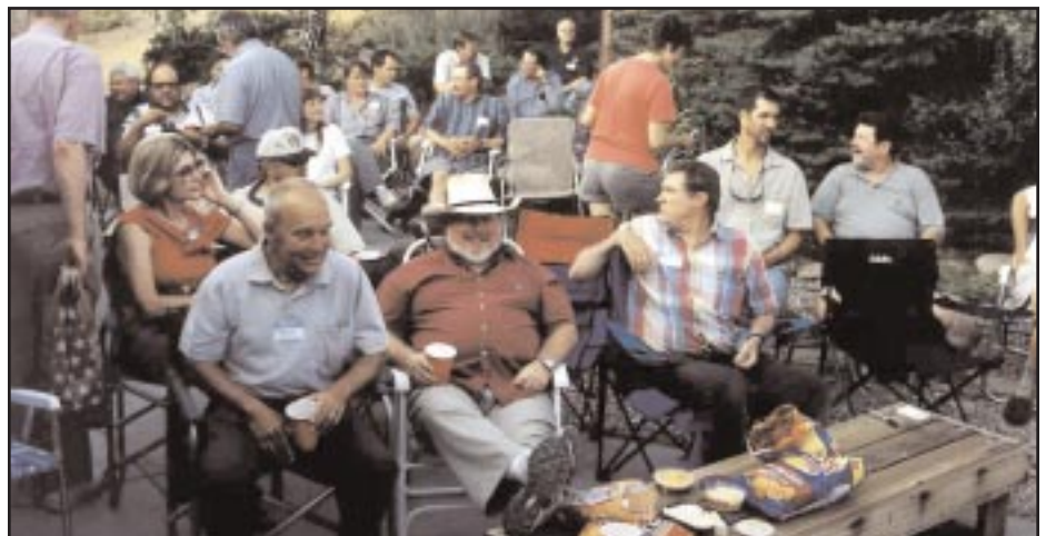
Stop 3. Sit back, prop your feet up, and enjoy the snacks!