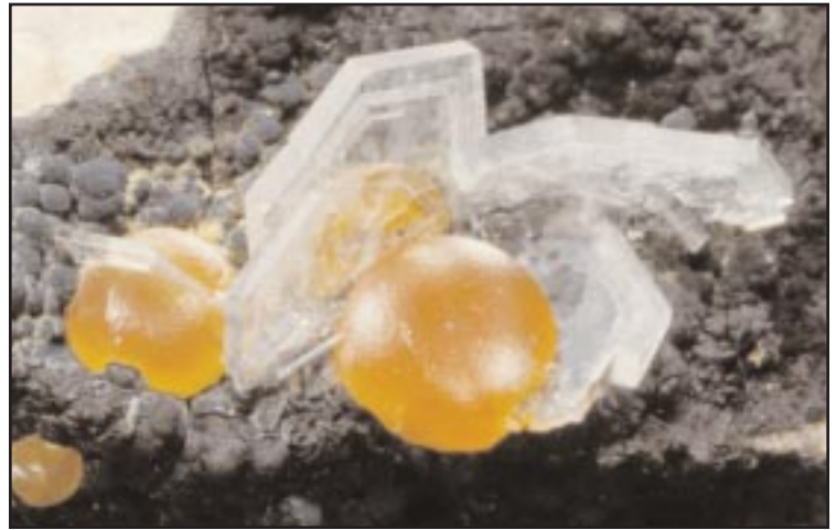
Rhodochrosite (orange) and Barite (white), spheroids to 5 mm, Lone Tree Mine, Buffalo Mountain district, Humboldt County

Minerals of Nevada is intended mainly as a reference source. It is designed for use by collectors, mineralogists, earth science researchers, exploration geologists, prospectors, and interested laymen. The book is slated for publication in August 2003 by the University of Nevada Press and the Nevada Bureau of Mines and Geology.