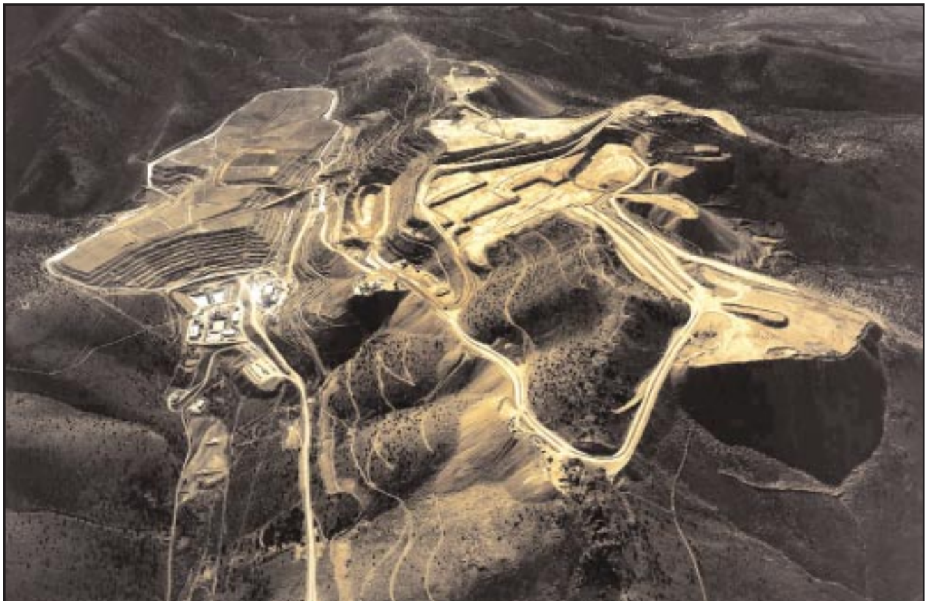
Field trip participants can compare 2002 to this 1992 photo of the Rochester Mine.

NON PROFIT ORGANIZATION U.S. POSTAGE PAID RENO, NV PERMIT NO. 625