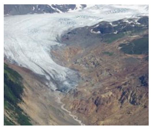
KSM Mitchell deposit looking Southeast

The deposit boasts 38.2 million ounces of gold, 9.9 billion pounds of copper, 191 million ounces of silver and 213 million pounds of molybdenum provable and probable reserves.